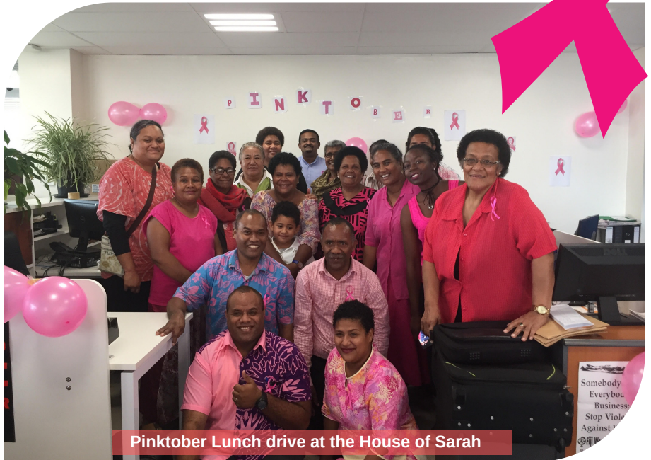
Pinktober Lunch drive at the House of Sarah

Bula Vinaka, Talofa lava, Malo e lelei, Namaste, Kiora Welcome to the second issue of the House of Sarah (HoS) newsletter for 2018. A lot of events have taken place over the last 5 months and we would like to share some of them with you in this 2nd copy of our newsletter for 2018. Vinaka.