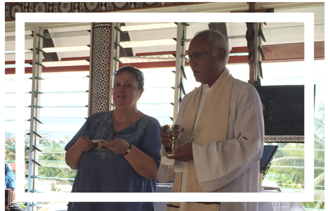
Farewell service at the MAST Chapel