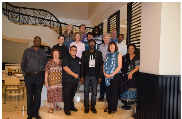
Photo caption : Members of the Anglican Communion Safe Church Commission at Vistana Hotel, Kuala Lumpur.