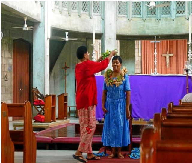
to attend a 2 weeks Christian Caregiving

of Activism against Gender-based Violence. Throughout the world women and men advocate and promote a safer world for women and children. Last year (2013) the church also took part in this campaign. It was marked by a special 'Break the Silence' Sunday on November 24 th and also an ecumenical 'Break the Silence' seminar and worship service held at Holy Trinity Cathedral on 6 December.