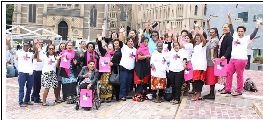
Delegates to the UN Women's Pacific grantees Learning Exchange in Melbourne's Federation Square